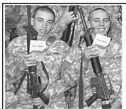
Soldiers at Fort Jackson with their guns and Bibles.

Throughout history, real social change has happened when ordinary people get pissed off with business as usual, talk to each other, get organized, and take to the streets. We have surely reached the point when we the ordinary people are truly pissed off. We have seen the wealthiest section of society get a wee bit worried and been handed billions of tax payers money. While we have been told that cuts in social spending are unavoidable. We face massive unemployment at the time of these cuts and we get that shit, 'We are all in this together". If we expect the corrupt politicians and the corporate world to sort our problems then we deserve all we get. So, we're pissed off, can we talk? Can we get organised? Can we take to the streets and bring about real social change?