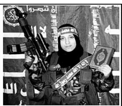
Hamas suicide bomber with guns and Koran.