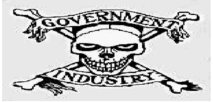
QUOTE: "Everyone has the right to a standard of living adequate for the health and well-being of himself and his family, including food, clothing, housing and medical care and necessary social services, and the right to security in the event of unemployment, sickness, disability, widowhood, old age or other lack of livelihood."

To save the planet and try to clean it up we first have to clean up the economic structure of our society. Capitalism must go, the interest of the corporate world and the people of the world are incompatible. The food, even when parliament is in recess. I'm sure there will corporate world wants increased profits for that small group of parasites, the people want sustainability, dering how the hell do you manage to eat £400 worth of justice and equality for all.