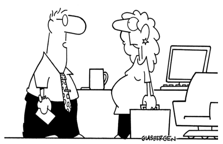
"No fingerprints, no picture ID, no Social Security number. I'm afraid your baby presents a serious security risk."

Copyright 2006 by Randy Glasbergen. www.glasbergen.com