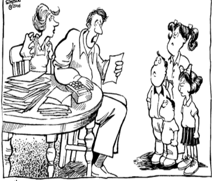
"According to our calculations, we can make it if we become a six-income family."